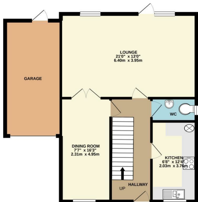
GROUND FLOOR 757 sq.ft. (70.3 sq.m.) approx.